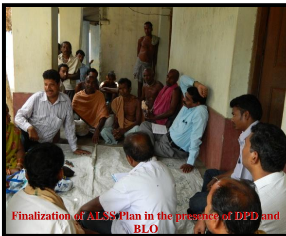
Finalization of ALSS Plan in the presence of DPD and BLO