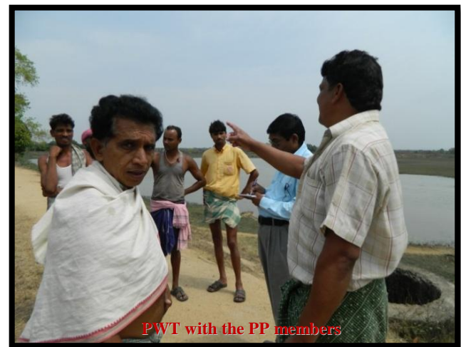
PWT with the PP members