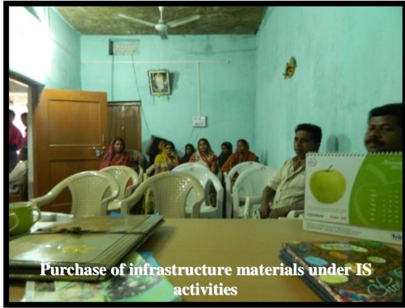
Purchase of infrastructure materials under IS activities