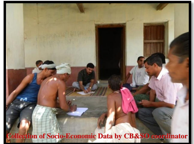
Collection of Socio-Economic Data by CB&SO coordinator